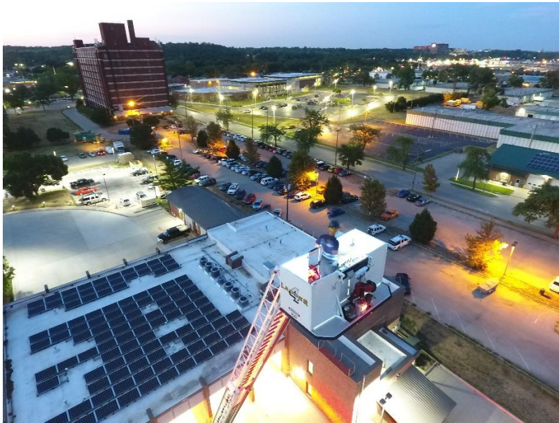
1815 Howell Street, North Kansas City, Missouri