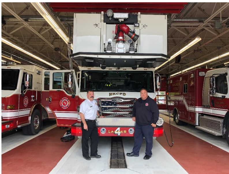
1815 Howell Street, North Kansas City, Missouri

Education was provided during fire prevention week with the North Kansas City Library. Educational tips are also provided through the City's website. Smoke detectors are provided and installed for homeowners here in North Kansas City. Numerous station tours and educational events are given to groups such as the boy/girl scouts.