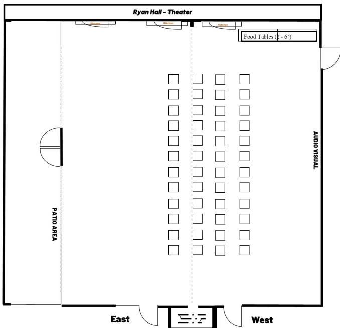
Ryan Hall - Theater